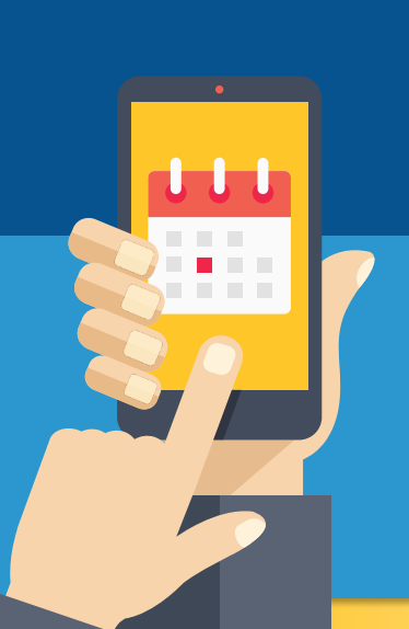
Address & Phone Number

If adopted in a final rule, health IT developers would be required to update their certified health IT to support the USCDI v1 for all certification criteria affected by this proposed change.