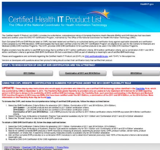
Previous CHPL Home Page